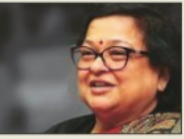
Justice Gita Mittal