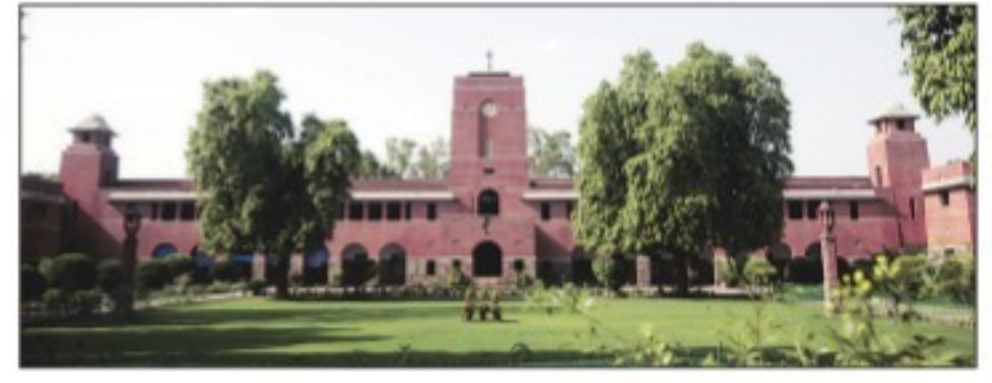
The event was scheduled on August 1. Archive

EXPRESS NEWS SERVICE NEW DELHI, AUGUST 8