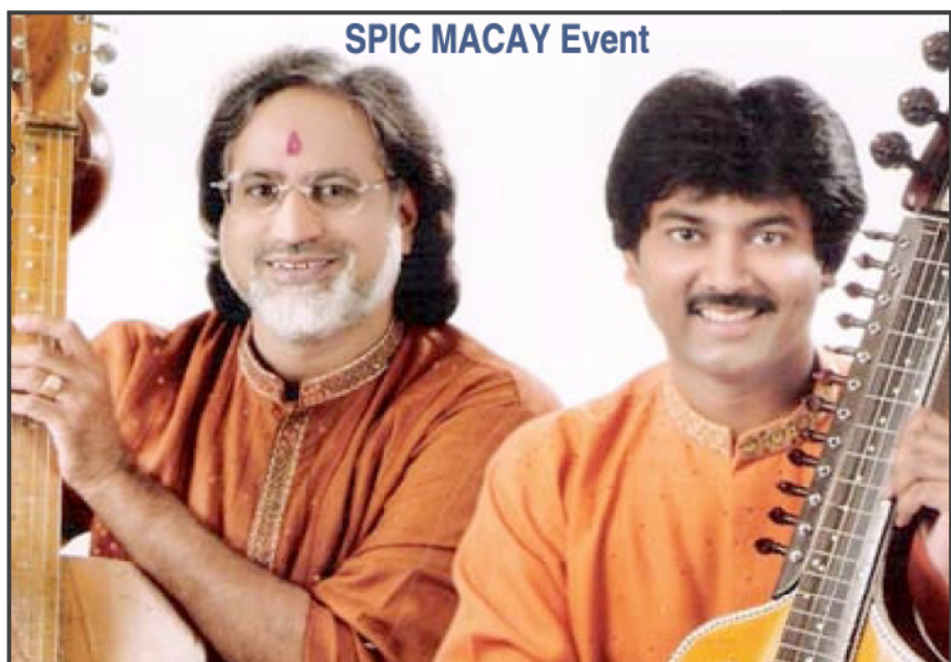
SPIC MACAY Event