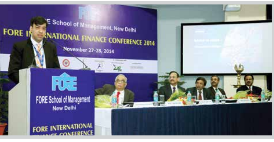
The esteemed panel of a technical session