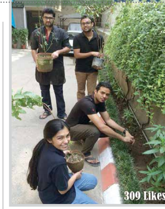
Sanrakshan-Volunteers in Action

On the day of the event, even though it was a Sunday morning, students woke up early and came to college to get their hands dirty. Students were divided in groups of 2 or 3 and taken to the different institutes in and around the Qutub institutional area. Then the students planted different saplings at their designated institutes and took a selfie and uploaded it on ANTAR's Facebook page.