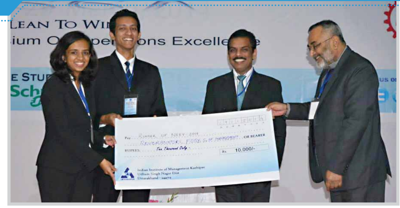
FORE students at IIM Kashipur

IIM Kashipur organised a flagship event "NEEV" on Operations Excellence followed by National level "Supply Chain Case Study competition" at its campus on November 29, 2014. The case study competition was based on Schneider Electric's supply chain management and lean operations.