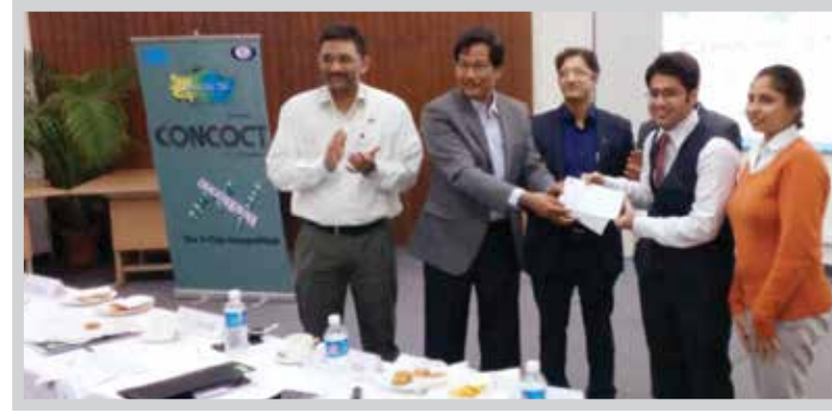
Judges felicitating the winners of Concoct