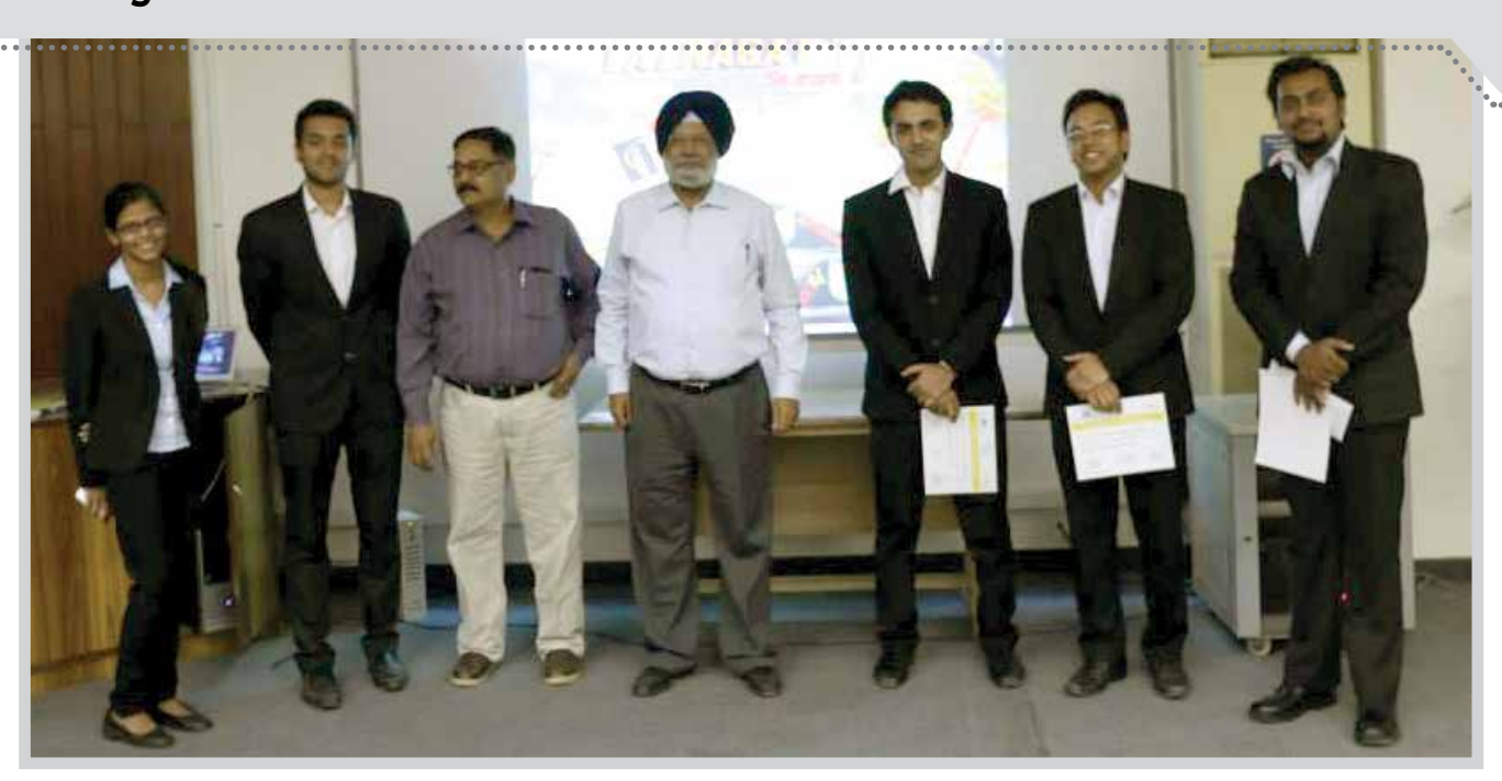
The Judges with the winners of the event

Tathagat , an event annually organized by Think Tank, gives the students a chance to put on their strategic hat and gauge the current market scenario of a particular industry, analyze the trends, identify problems and give relevant solutions. The theme for this sixth edition of Tathagat 2014 was the e-commerce industry, focusing on Amazon's growth potential in Asia.