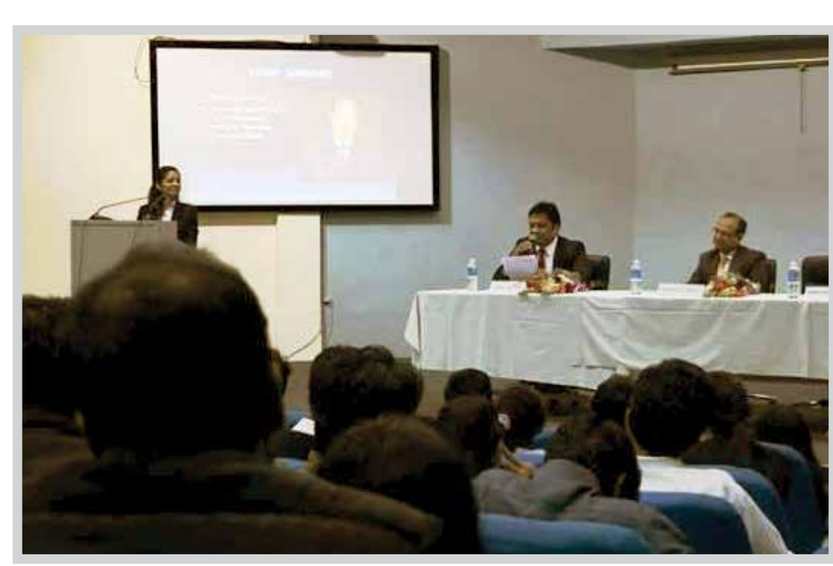
A glimpse from the session

as possible. Chairman and Vice President were only a podium away from the students, an opportunity the students were not willing to let go off. Questions and answers session ensued and the speakers answered with fervour and enthusiasm (only with an additional dose of wit that had the audience in splits).