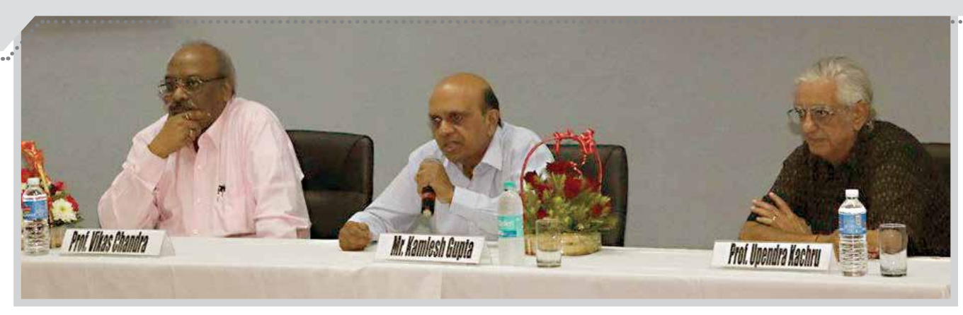
Speakers at the operations conclave

Operations Conclave was held on October 31 2014. The topic of discussion was 'Global Value Chain'. The aim of discussion was to bring together speakers from operations function and give a complete perspective of how the value chain of global businesses function. The value chain includes a full range of activities that are required to bring a product from its conception, through its design, its sourced raw materials and intermediate inputs, its marketing, its distribution and its support to the final consumer.