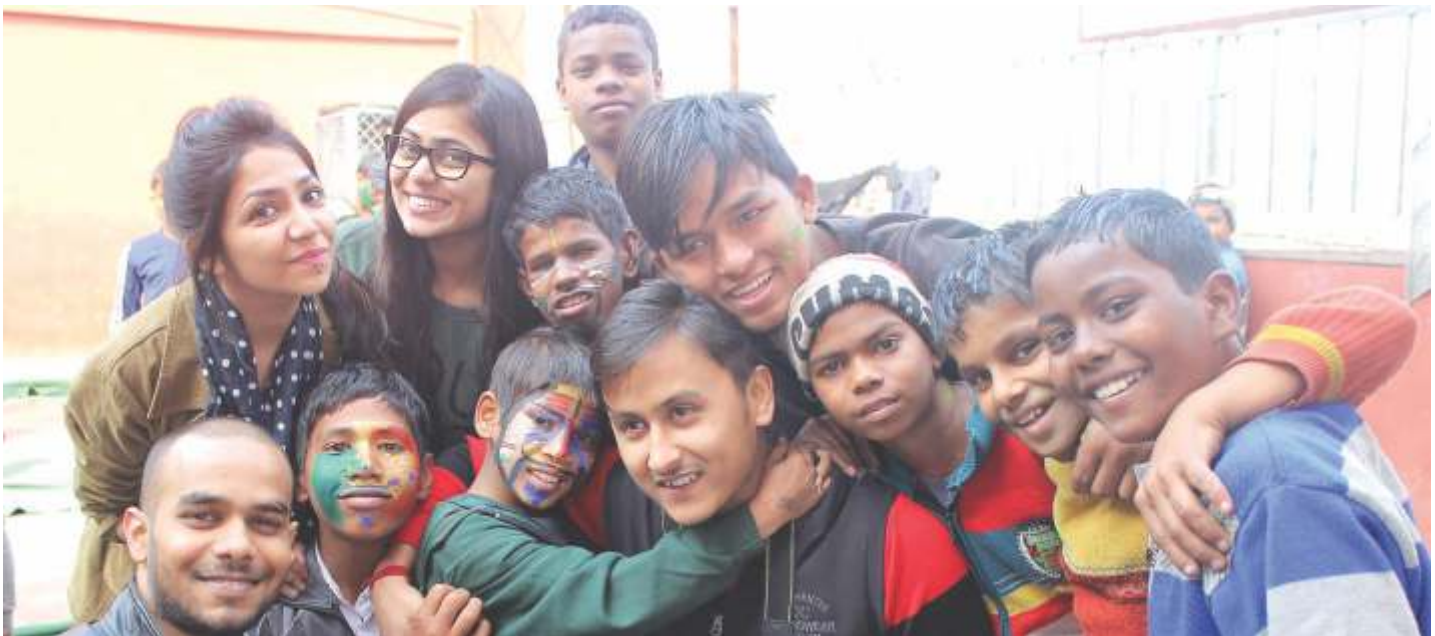
Students from FORE along with children from Salaam Baalak Trust

Aashayein is an annual flagship event of Team Antar where students spend their time with children of shelter home. This year, it was organized on January 8, 2017 in Salaam Baalak Trust, a shelter home for boys by DMRC. Around 45 volunteers and 16 team members of Antar took out time to spread joy in the lives of 130 children for one day. The event started with one of their favourite activity, drawing competition, wherein the boys were given crayons and told to draw and colour as they pleased. All of them drew amazing sketches, including their favourite cartoons, action heroes and lake side sceneries. This was followed by 'Face Painting' as they were eagerly waiting for volunteers and team members to paint their faces and some of them played with the colours till the end. The boys willingly posed for pictures and proudly showed off their painted faces. Football, cricket and badminton were next in line wherein some children displayed their sporting talent while the others just enjoyed themselves.