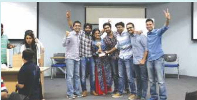
Winners of Quizzark

On March 14, 2017, Think Tank conducted their last competition of the academic year named Quizzark at the Virajam Auditorium. It was an inter section quiz competition for the first year students. Sections had to battle it out in topics like Movies & TV, Marketing, Finance, Sports, OB-HR, India. The event had four rounds. In the first round, first three questions were followed by an activity round where one representative from each candidate has to take a push ups for one minute which was then again followed by three quiz questions. The second round was a rapid fire round event where questions were based on FORE School of Management. The next round was a memory test round where participants were asked to repeat a set of words that were first said to them. The last round again had three questions. The event also had some fun activities like collecting maximum one rupee coins, taking maximum push ups and so on. Section C topped the competition and Section A ended as runners up.