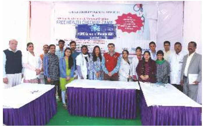
Teams from FORE School of Management & Rockland Hospital Manesar during the health camp at Manesar