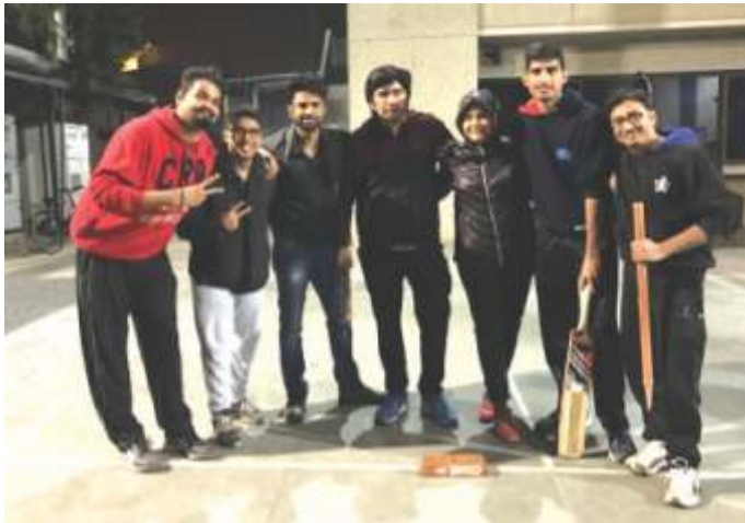
Winners of Box Cricket 2017

FORE Sports and Cultural Division organised Box Cricket League Season 2 which started on January 23, 2017. The tournament went for a week. Venue for the tournament was parking lot. There was enthusiasm and excitement about the event.