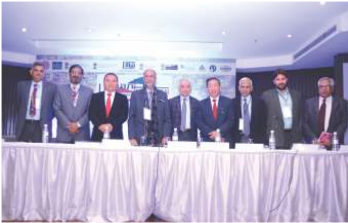
Panel at Urban Futures: Reinventing our cities - Balancing Opportunities with Equity, during February, at India International Center, New Delhi

FORE School of Management in association with the Center for Urban Green Spaces has organized the conference on “Urban Futures: Reinventing our cities - Balancing Opportunities with Equity” during February 09-10, 2017 at India International Center, New Delhi. More than 150 delegates from various corporate and academia participated in this conference.