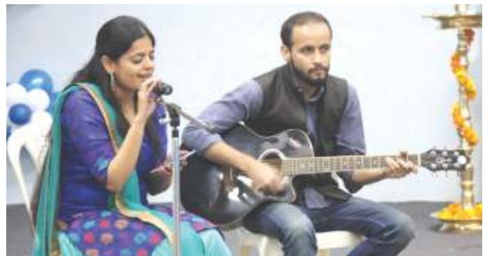
Students performing at the event

was followed by musical chair and cake cutting ceremony along with gift distribution. A quiz relating to movies was also held, where pictures from old Hindi movies were shown and the senior citizens had to guess the movies. Students at the college had also prepared cultural dance performance. This marked the end of the event and volunteers took the senior citizens back to their old age homes.