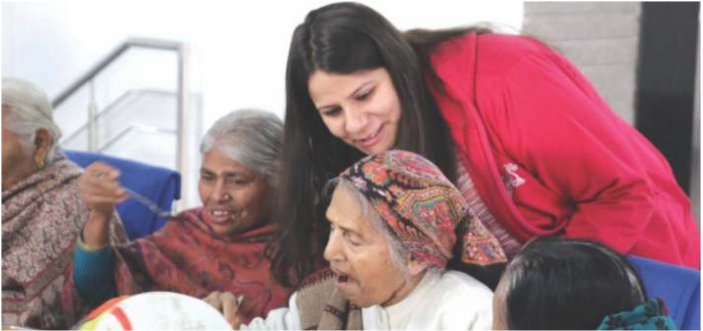
Elders along with students at Abhivadan 2017