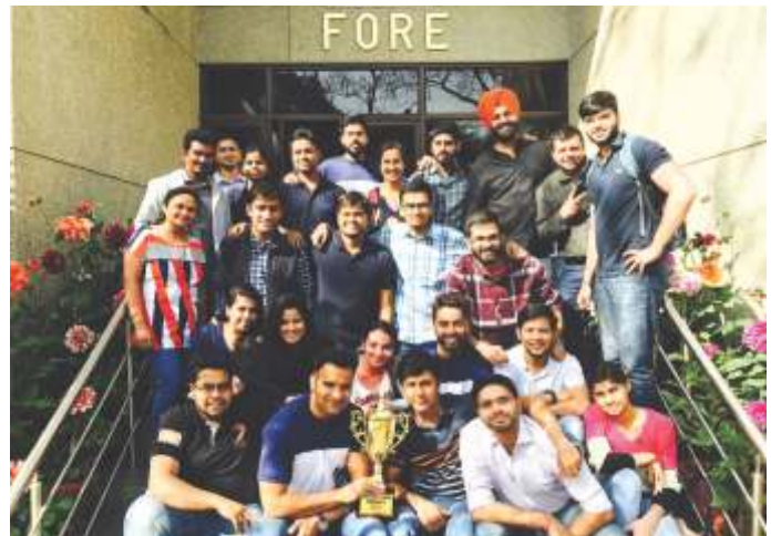
Winners of Section Wars with trophy

FORE Sports and Cultural Division organised final event for the year 2016-17, "the Section Wars", a comprehensive sports and cultural fiesta. Tournaments of table tennis, badminton, throwball, pool, foosball, cricket, carom, chess and tug of war were conducted. On the cultural side talent hunt was organised. The event went on for a month starting in February. The participants for the event proved their mettle in almost every event and showcased their strength within the ground as well as outside it.