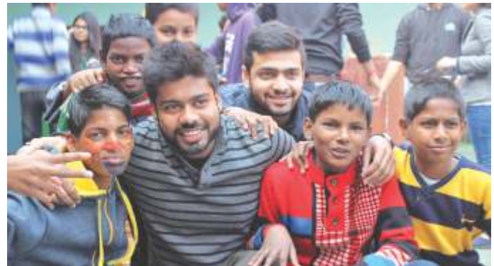
Volunteers of Aashayein 2017 posing with children with painted faces

along with them. Team Antar also organized speakers and everyone danced together. The volunteers and team members spent a lot of time interacting with the children; playing carom, listening to their stories and giving them piggy back rides. The day ended around 6 pm when the children were given burgers, muffin, toffee and chocolate to eat. Each child was also given warmers. It was indeed a beautiful experience, not only for all the children but also for FORE students who got a chance to spend time with them and gathered sweet memories to cherish. Bringing smiles to innocent faces is the best gift ever.