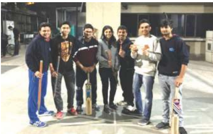
Runner up of Box Cricket 2017

The winners of the event were Team AlphaQ Champions who scores 35/0 in 3.5 overs while the runner up Phapdas and Khakdas scored 34/7 in 5.5 overs.