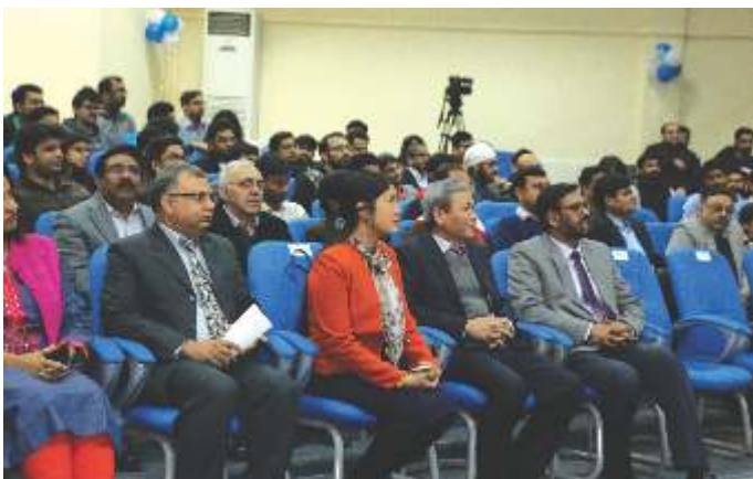
Faculty, students and guests during the book launch