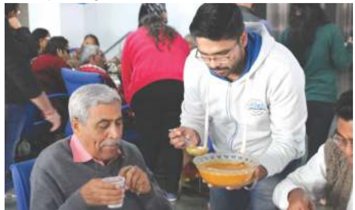
Volunteers of Abhivadan 2017 serving elders