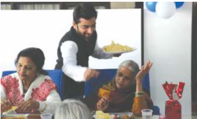
Volunteers of Abhivadan 2017 serving elders