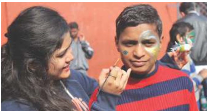
Face-painting in progress