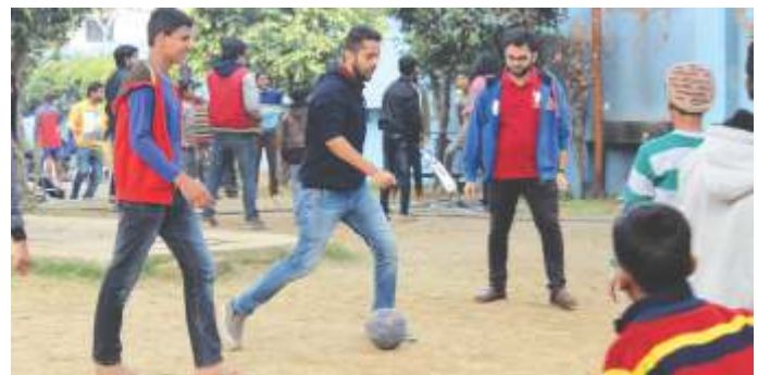
Volunteers playing football with the children