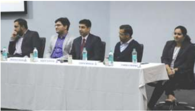
Alumni panel at Panchtatva 2017