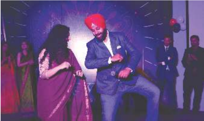
Moments of joy at the Farewell party.

All in all something like farewell has really stirred up many deep emotions within all, and has caused strengthened bonds and friendships. There were beautiful gifts and photograph given as token of love to the seniors. Aside that dismaying thought of leaving, in the end, everyone was satisfied, happy and excited about their futures.