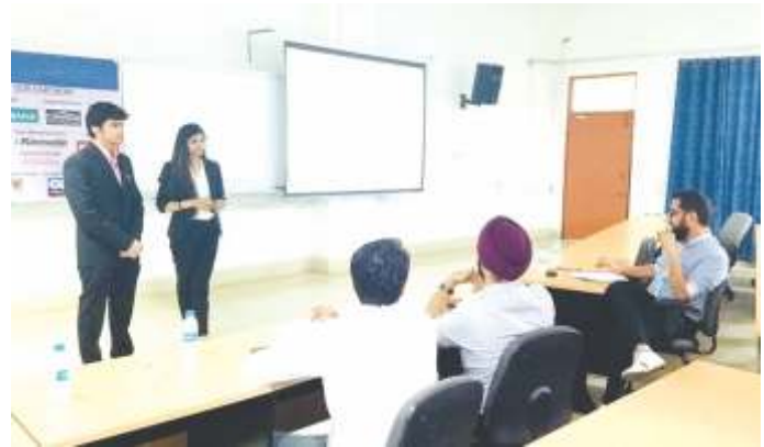
FORE Students at Case Study competition at IIM Raipur.

Great things never come from the comfort zone. With great pride, we congratulate all the winners who have done us proud.