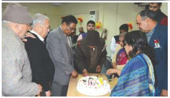
Senior Citizens from Old Age Home slicing the cake at Abhivadan 2018

The best classroom in this world is at the feet of an elderly person. In order to make Senior Citizens from Old Age Homes loved and cared for, Team Antar, the CSR Committee at FORE School of Management organized Abhivadan on January 31, 2018. The team invited Senior Citizens from Gharaunda and Sandhya Senior Citizen Home to make their day memorable by organizing and participating in activities with them. The event started at 11 am with a traditional welcome of the guests at Virajam Auditorium.