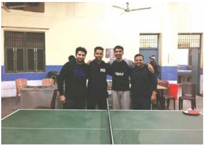
Winners of Table Tennis Competition held at IIM Rohtak

became the overall champion by winning the most number of gold and silver medals at the event in various sports viz. Throwball, TT, Badminton and Carrom.