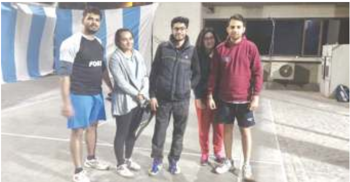
Badminton Team of FORE at IIFT Sports Fest.