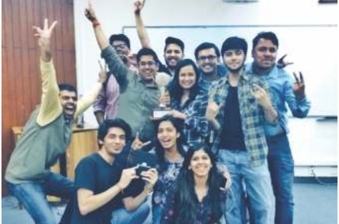
Winners of Quizzark 2018: FMG 26 B.

Quizzark is way of simulating the competition in the intracollege environment. It gave a unique opportunity to all the sections to display their intellectual prowess. The event was conducted on March 8, 2019 at FORE School of Management. It was a multi-subject quiz in which each team belonging to each of the five sections were quizzed. This entire quest was targeted at winning the "Quizzark Cup". The competition was very stiff but Section B triumphed above all and bagged the First position. They were followed by Section A, which bagged the First Runner-up position. In totality, the event was a great example of fun & learning.