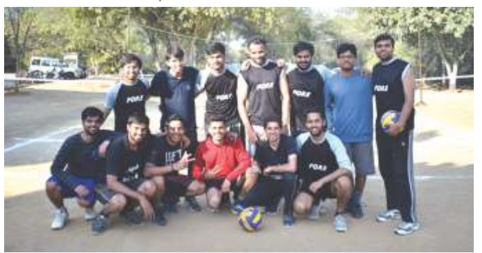
FORE Volley Ball team at IIFT, Delhi.