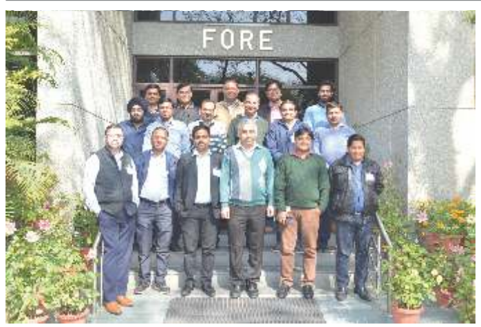
Faculty along with participants of an MDP

FORE School of Management conducted 4 open Management Development Programmes at its Campus at New Delhi during January-March 2018. The details are as follows: