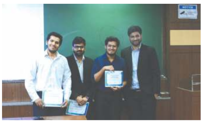
Winners of Finish Line 2018 with their certificates.

Team Think Tank successfully conducted its distinctive and one of a kind event- Finish Line: Dare to Bank on your Instincts? -on February 19, 2018 at FORE School of Management.