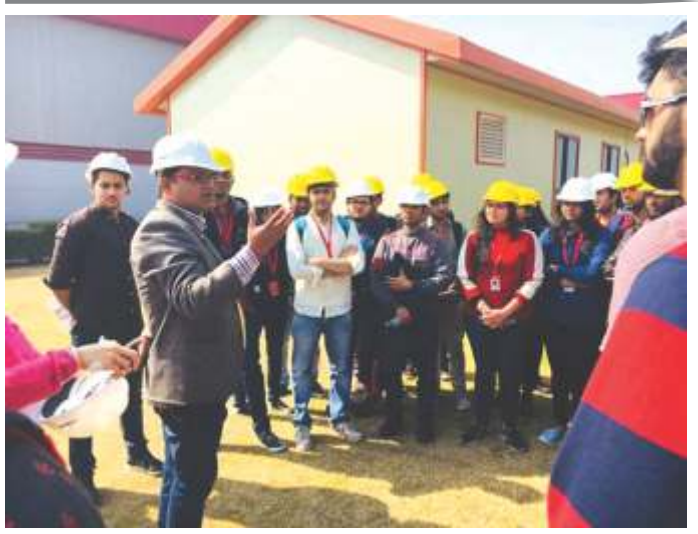
Personnel from Multicolor Steels (India) Pvt. Ltd. addressing the students of FORE at their plant.

On February 9, 2018, students from FORE School of Management went on an educational industrial trip organized jointly by QT & OM Area and Team FOSTRA, to the manufacturing unit of Multicolor Steels (India) Pvt. Ltd. situated in Bawal, Haryana. The factory dealt in pre-engineered building, which is easy to erect and has a long life and high scrap value