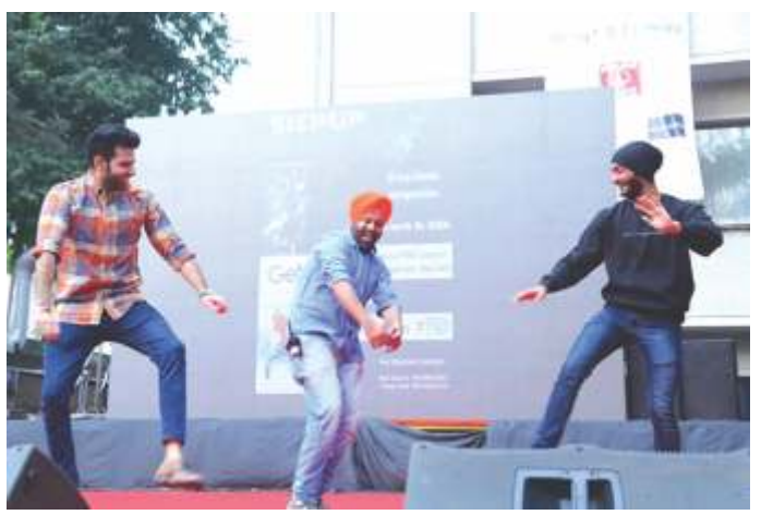
Stunning performance of FOREans

and also some economic events like demonetization. The teams were judged on the basis of message delivered, context, dramatic skills and the involvement of audience.