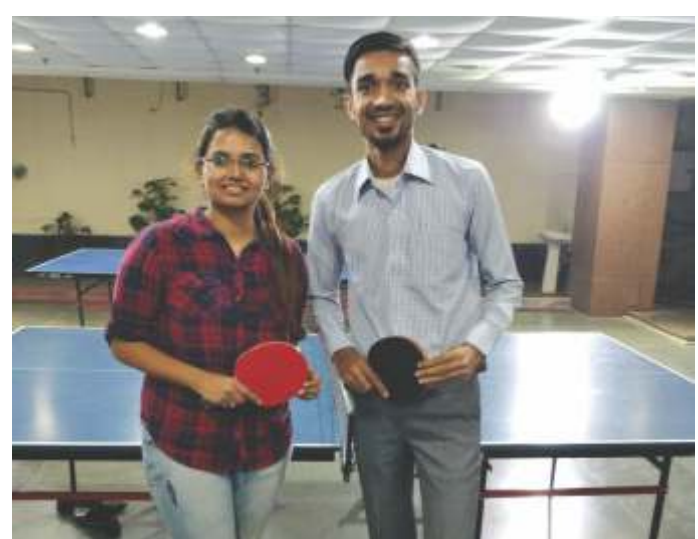
Winners of Karve mixed doubles

All the participants were experiencing enthusiastic and tried to secure the top position without most vigor and put all the sweat of their brow to finally achieve the position they want. In the end, hugely successful event brought all the table tennis lovers together and were able to make the event, the indoor sports event of the season.