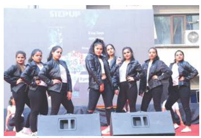
A thrilling performance by participants of Step Up

interjection & the topic was "Is corruption the price for democracy".