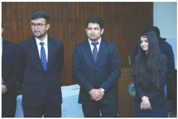
Participants at a competition during Genesis'17

As part of Genesis the annual management festival of FORE School of Management, New Delhi, team FEFF presented a competition where participants were tested upon their speed, wit and judgment to see if they survive in the trade market. The competition was held in three rounds, wherein, Round 1 was an online quiz and Round 2 was checkers round. The 3rd round was a mock trading session where teams were allocated money