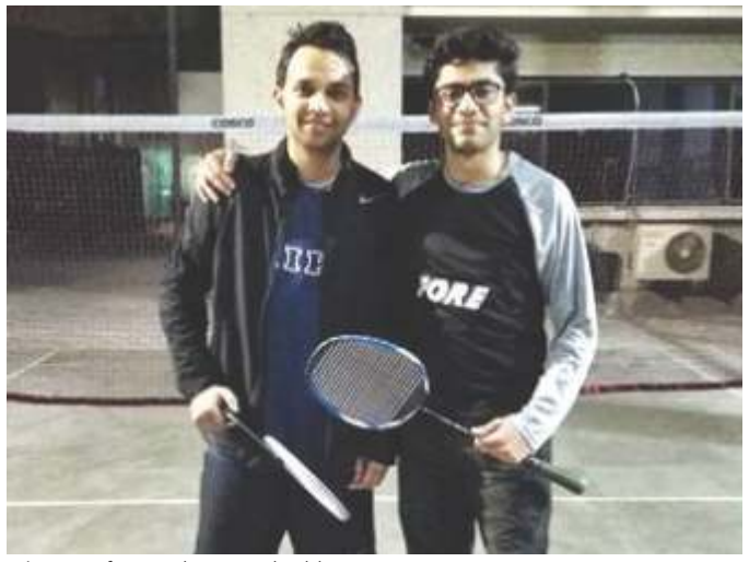
Winners of Smaash men's doubles

The badminton tournament of FORE School of Management is here. One of the most awaited outdoor tournament brought together all the smashers to the court. The thrilling tournament saw a huge turn-out both from the participants as well as the audience. The chilling evenings could not deter the enthusiasts who were warmed up by the cheering crowd.