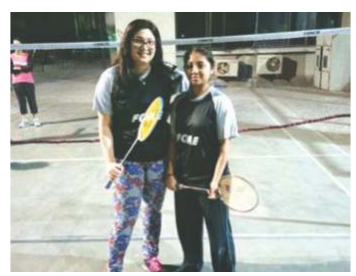
Winners of Smaash women's doubles

All the winners put our their heart and soul in to the tournament and they the enthralling performances and the competitive spirit that was witnessed by all present was an example of the rigour and vigour of the sports community here at home.