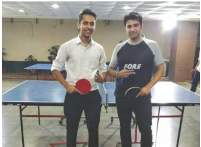
Winners of Karve men's doubles

FSCD organized an event Karve which was a table tennis competition. There were 4 categories in which the students participated, Men's Single, Men's Double, Women's Singles and Mixed double. There was a huge participation from all the students. All people who attended the event were thrilled by the action that they witnessed. Participants were jumping around, stretching to save a point and at the same time twisting ankles to score over the other. In the end the event ended up with the following winners -