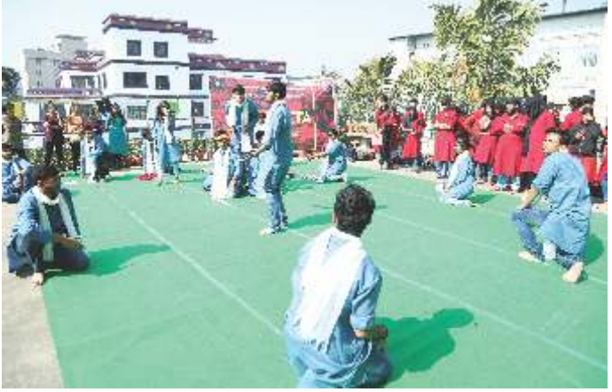
A participating Team conducting a Nukkad Natak for the event Jagrukta

The two day extravaganza of Genesis'18 is incomplete without the mention of Ba-czar. It is a two day intra college event Organized by CED for the first year students wherein they implement their "Street Business Ideas" and get a hands on experience of entrepreneurship. Six teams participated from the college & served a range of delightful cuisines which helped them garner revenues totaling to ₹1.5 lakhs.