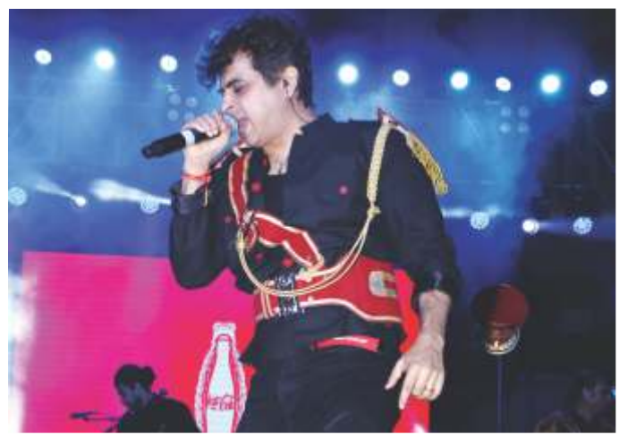
Lead Singer of the Band Euphoria, Palash Sen, thrilling the crowd on the closing night of Genesis 2018

shortlisting round. The shortlisted teams were called for the debate round.