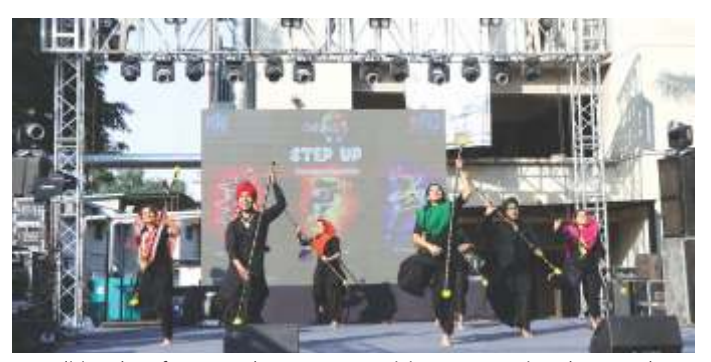
A traditional performance by Step-up participants engaging the crowd FORETech. This was an elimination round after which select

The tech committee of FORE school of management, brought an event which aims to push the presentation making techniques and slide designing techniques of management graduates and help them earn cash reward in the process. The event was organised in two stages, the first round of the competition was an online round where participants had to submit 3 slide presentation on a topic chosen from a list of 5 topics given by