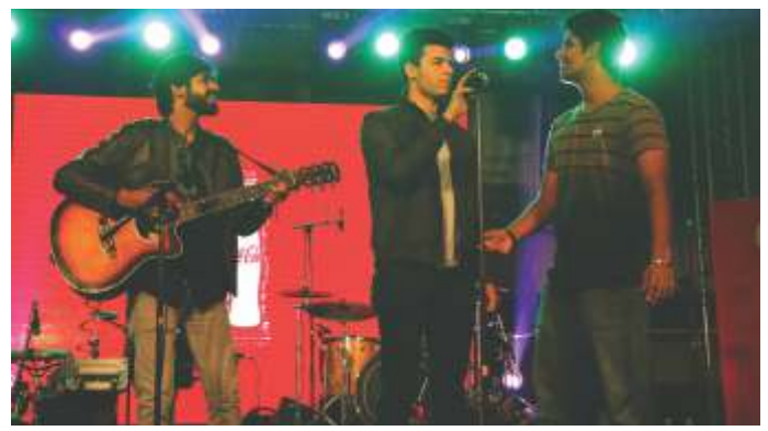
Students of FORE warming up the crowd by exhibiting their excellent singing prowess

This Genesis, Team FEFF organized a simulation based game where the participants were tested upon their counter intuitive logic and decision making. The first round of the competition was an online quiz testing the basic awareness of the candidates