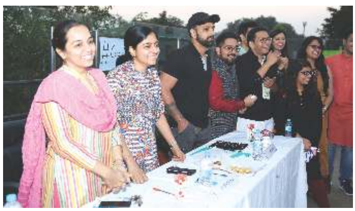
Judges for the event Jagrukta along with team Antar, enjoying the entertaining performance