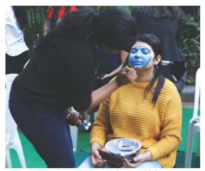
Participants showcasing their artistic sides during Pratibimb