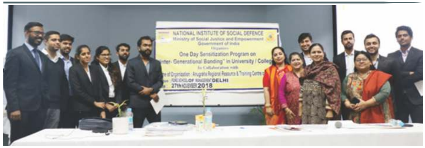
CSD Team with the eminent speakers after an effective Sensitization Program

In light of the vast multitude of activities responsible for sustainable growth, Center for sustainable development (CSD) organized a Sensitization program on "Inter-Generational Bonding" for the first year students of FMG, IMG and FM batch on November 27, 2018 at FOREcampus. The program was sponsored and in association with Anugraha, a national NGO, works as Regional Resource & Training Center on Ageing, under the aegis of the Ministry of Social justice & empowerment, Government of India.