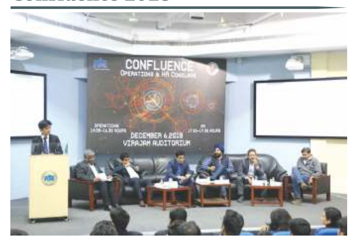
Esteemed panel for Confluence 2018, being addressed by a member of team CID

On December 6, 2018 Team Corporate Interaction Division of FORE School of Management organised its second conclave of the year, Confluence 2018, at the venue of the B-school. The previous conclave was based on Finance and IT, while this time, it was based on Operations and HR.