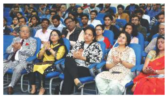
A snap shot from the opening ceremony of Genesis 2018

Vyamaham 2017 was organized by SIG HR to test the skills of students in the HR field. The competition was divided into two parts: Online Case Study Analysis which was the preliminary