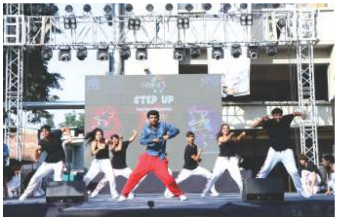
A titillating dance performance by one of the participating team of Step-up

This Genesis, team SigMa conducted its first case study event - Impersonate: Think like a CMO, where participants had to put their marketing knowledge and analytical skills to test and try to