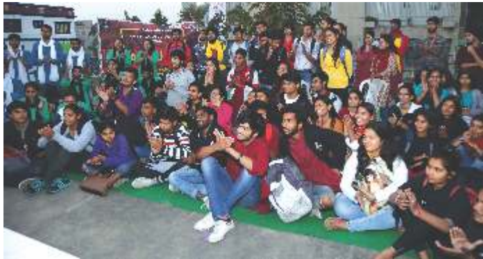
Audience encouraging the event Jagrukta

As part of Genesis the annual management festival of FORE School of Management, New Delhi, team FEFF presented a competition where participants were tested upon their speed, wit and judgment to see if they survive in the trade market. The competition was held in three rounds, wherein, Round 1 was an online quiz and Round 2 was checkers round. The 3rd round was a mock trading session where teams were allocated money according to their scores in round 2.