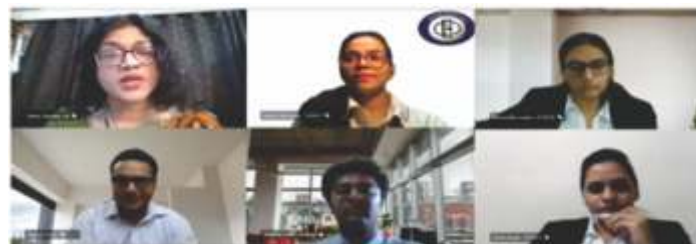
Escape Rooms @FORE During Genesis