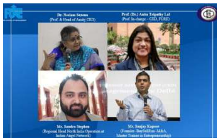
The speakers sharing their experiences in the event.