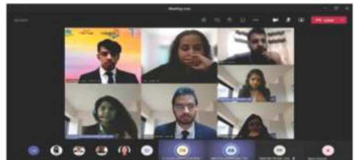
The Amazing Race

The Team Think Tank organised an another event named The Amazing Race: A Flagship Treasure Hunt event during Genesis-21. The event was considered as the highlight of the Annual Fest of FORE: Genesis which was packed with fun, creativity, intellect and strategy. This year it went international, where Team Think Tank planned a race like never before. The event received registrations from colleges across India with 78 teams in total. Virtual treasure hunt was organised with the help of Google's street view.