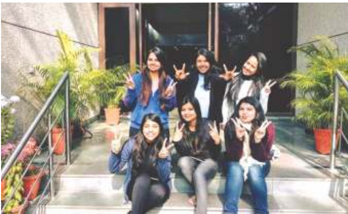
Winners of Women's Throw Ball competition at IIM Rohtak

The Inter-College Sports fest, INFUSION '18 , was held at IIM-Rohtak from January 12, 2018 to January 14, 2018. FORE School of Management, after two days of intense competition and great displays of sportsmanship in a closely fought contest,