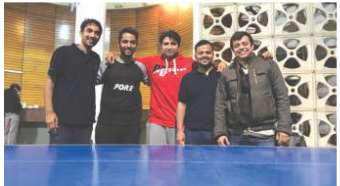
Winners of Table Tennis Competition at IIFT, Delhi

Winning Gold in Table Tennis against team from other prestigious colleges placed FORE in high regards. FORE School also bagged three silver medals namely in Cricket, Badminton & Volleyball. This stellar performance has put FORE right at the top in sports performance amongst all the other prestigious B schools.