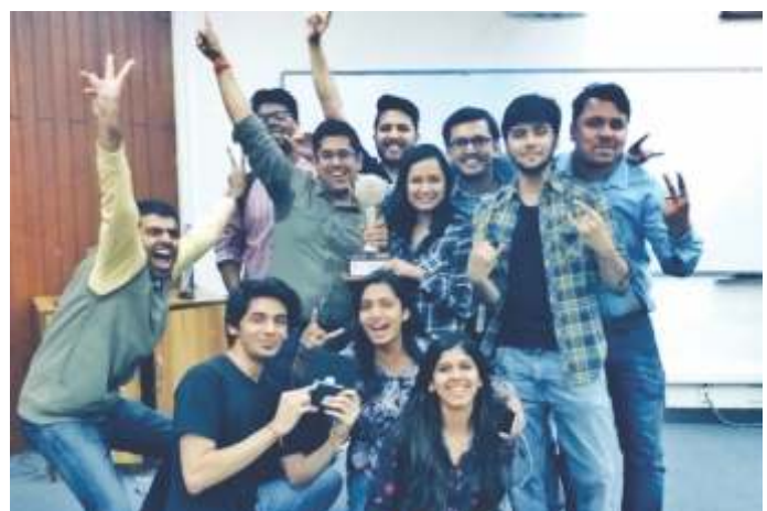
Winners of Quizzark 2018: FMG 26 B.

Quizzark is way of simulating the competition in the intra-college environment. It gave a unique opportunity to all the sections to display their intellectual prowess. The event was conducted on March 8, 2019 at FORE School of Management. It was a multi-subject quiz in which each team belonging to each of the five sections were quizzed. This entire quest was targeted at winning the “Quizzark Cup”. The competition was very stiff but Section B triumphed above all and bagged the First position. They were followed by Section A, which bagged the First Runner-up position. In totality, the event was a great example of fun & learning.