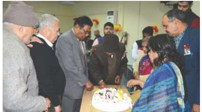
Senior Citizens from Old Age Home slicing the cake at Abhivadan 2018

The best classroom in this world is at the feet of an elderly person. In order to make Senior Citizens from Old Age Homes loved and cared for, Team Antar , the CSR Committee at FORE School of Management organized Abhivadan on January 31, 2018. The team invited Senior Citizens from Gharaunda and Sandhya Senior Citizen Home to make their day memorable by organizing and participating in activities with them. The event started at 11 am with a traditional welcome of the guests at Virajam Auditorium.