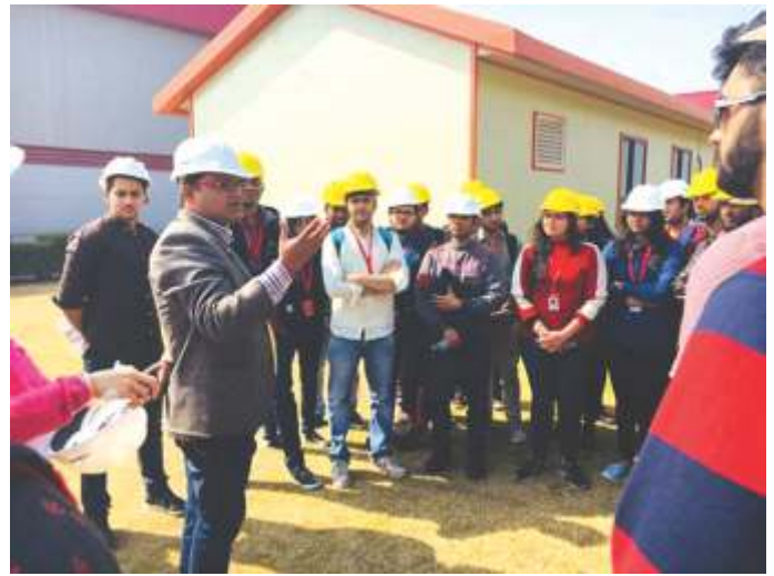
Personnel from Multicolor Steels (India) Pvt. Ltd. addressing the students of FORE at their plant.

On February 9, 2018, students from FORE School of Management went on an educational industrial trip organized jointly by QT & OM Area and Team FOSTRA, to the manufacturing unit of Multicolor Steels (India) Pvt. Ltd. situated in Bawal, Haryana. The factory dealt in pre-engineered building, which is easy to erect and has a long life and high scrap value.