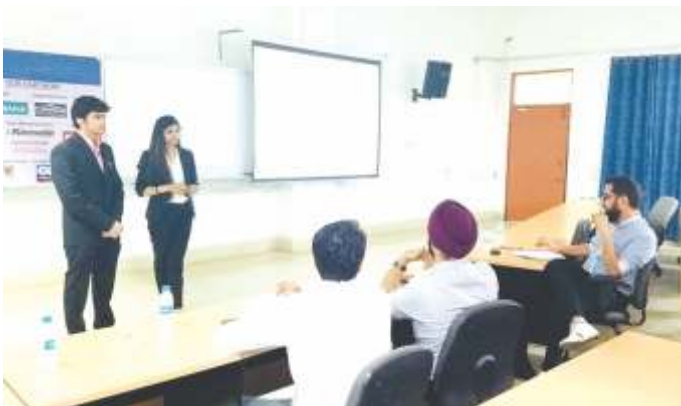
FORE Students at Case Study competition at IIM Raipur.

Great things never come from the comfort zone. With great pride, we congratulate all the winners who have done us proud.