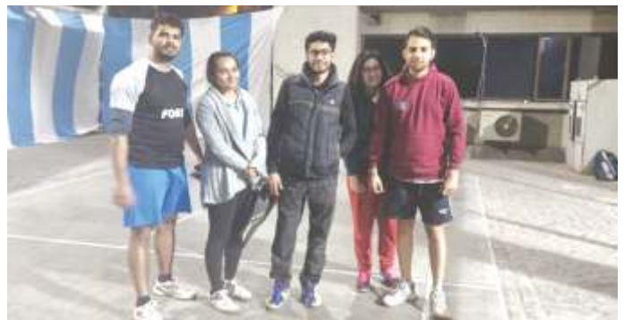
Badminton Team of FORE at IIFT Sports Fest.