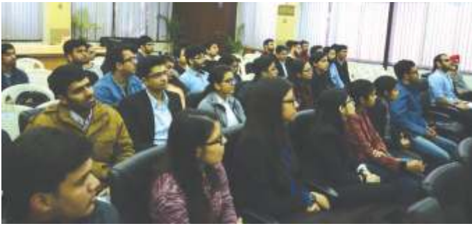
Participants of Melange workshop organized by Team SIG-Ma.