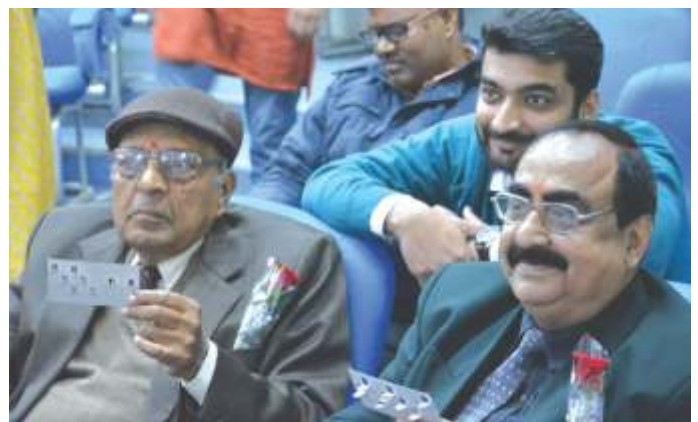
Smile is the biggest gift | Senior Citizens at Abhivadan 2018