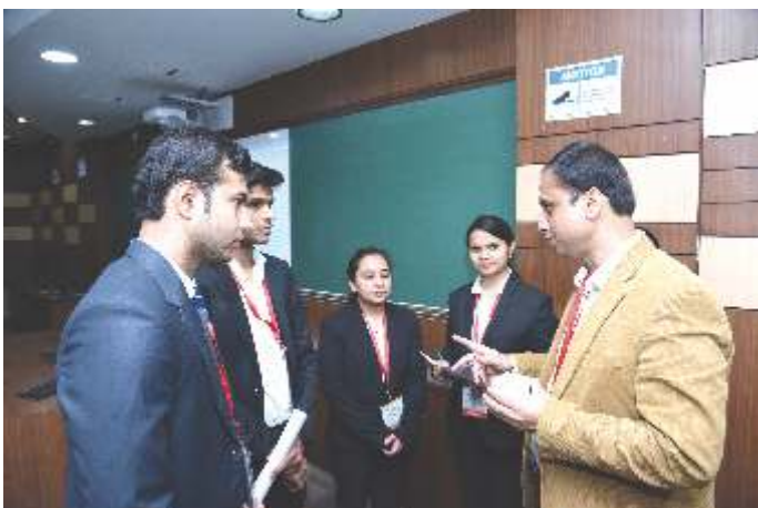
Conference organizers (students team) interacting with a speaker at FISDC 2018