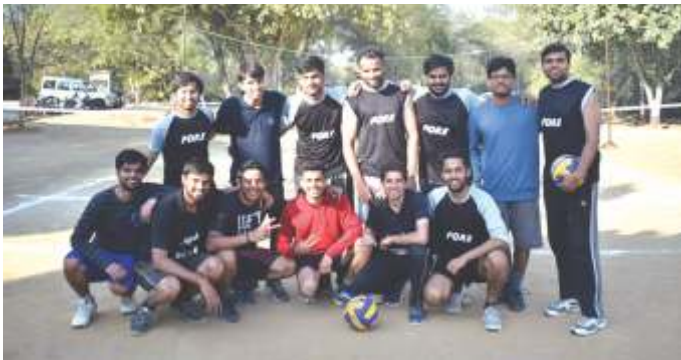
FORE Volley Ball team at IIFT, Delhi.