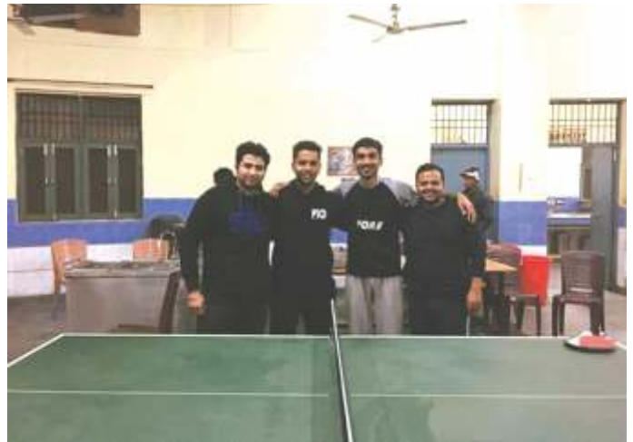
Winners of Table Tennis Competition held at IIM Rohtak

became the overall champion by winning the most number of gold and silver medals at the event in various sports viz. Throwball, TT, Badminton and Carrom.