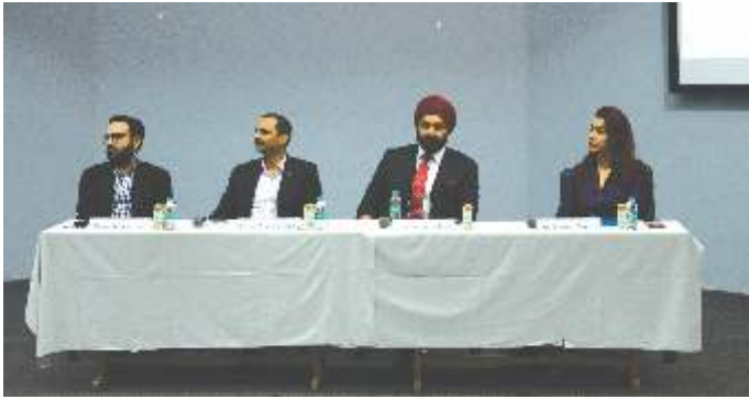
Alumni at Panchtatva 2018