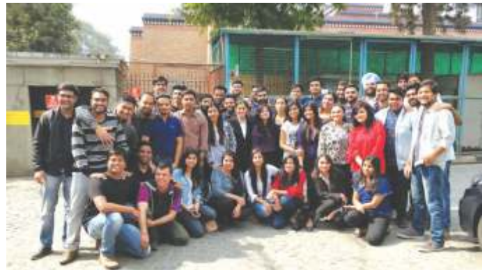
Winners of Section Wars 2018, FMG 25 B.

“Winning takes precedence over all. There's no gray area. No almosts.” – Kobe Bryant