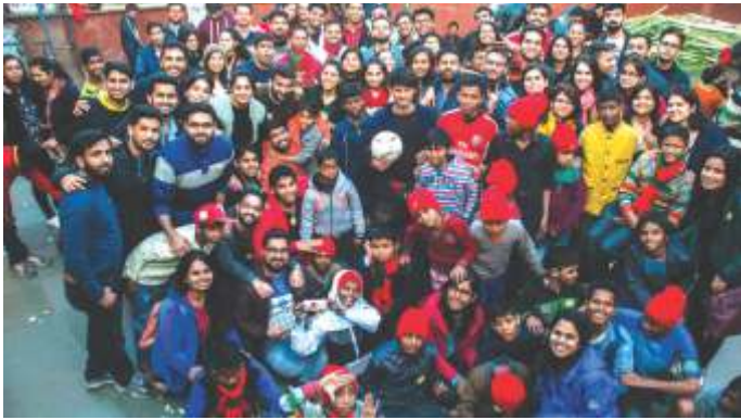
FORE's Students at DMRC Shelter Home | Creating a Difference

"Help others achieve their dreams and you will achieve yours" - Les Brown