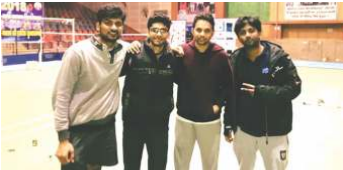
Team FORE at IIM Rohtak's Sports Fest.

The Inter-College Sports fest, INFUSION '18 , was held at IIM-Rohtak from January 12, 2018 to January 14, 2018. FORE School of Management, after two days of intense competition and great displays of sportsmanship in a closely fought contest,