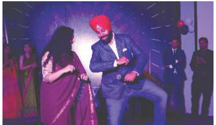
Moments of joy at the Farewell party.

All in all something like farewell has really stirred up many deep emotions within all, and has caused strengthened bonds and friendships. There were beautiful gifts and photograph given as token of love to the seniors. Aside that dismaying thought of leaving, in the end, everyone was satisfied, happy and excited about their futures.