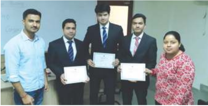
Winners at LeAgile 4.0:ReInvented, Tatva 2018

Three students of Batch 2017-19 brought home laurels by becoming National Winners at LeAgile 4.0: ReInvented, Tatva 2018 organised by Lal Bahadur Shastri Institute of Management, Delhi on February 11, 2018.