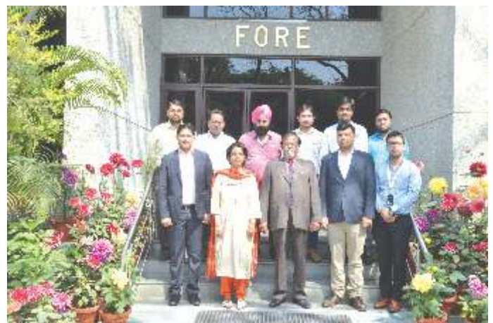
Faculty along with participants of an MDP