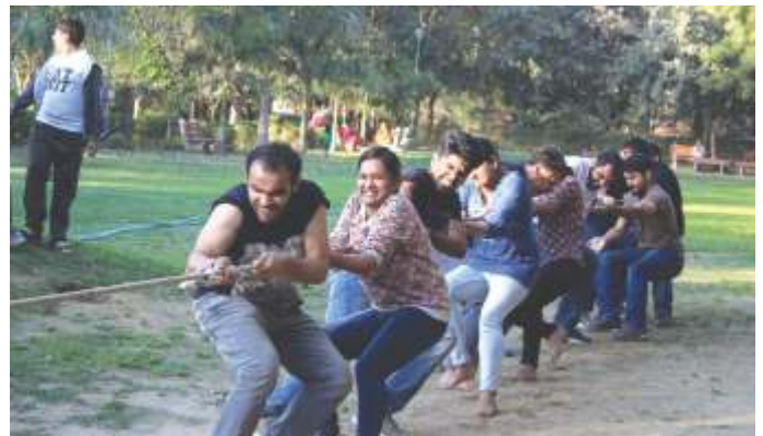
Enthusiastic participants at Section Wars 2018.

Repeating history, FMG 25B emerged as the winner and became the proud owners of a glittering trophy. The support shown by the section captain, participants and their fellow classmates was commendable which acted as an added advantage for their victory. The runners up for the event were IMG10.