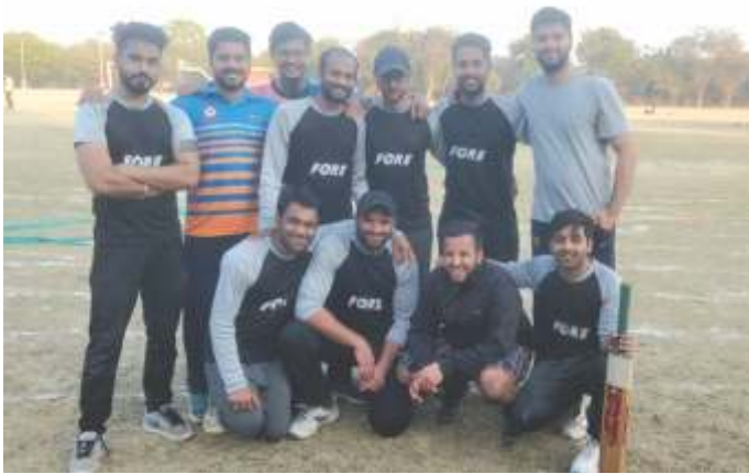
FORE Cricket Team at IIFT, Delhi.