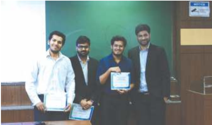
Winners of Finish Line 2018 with their certificates.

Team Think Tank successfully conducted its distinctive and one of a kind event- Finish Line: Dare to Bank on your Instincts? -on February 19, 2018 at FORE School of Management.