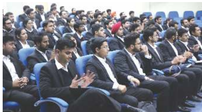
Students listening to speakers attentively