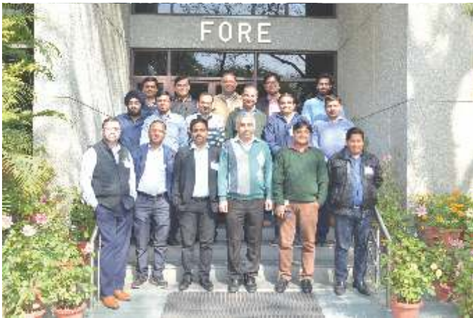
Faculty along with participants of an MDP

FORE School of Management conducted 4 open Management Development Programmes at its Campus at New Delhi during January-March 2018. The details are as follows: