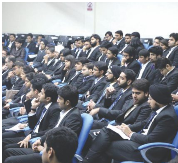
Students - Listening in rapt attention