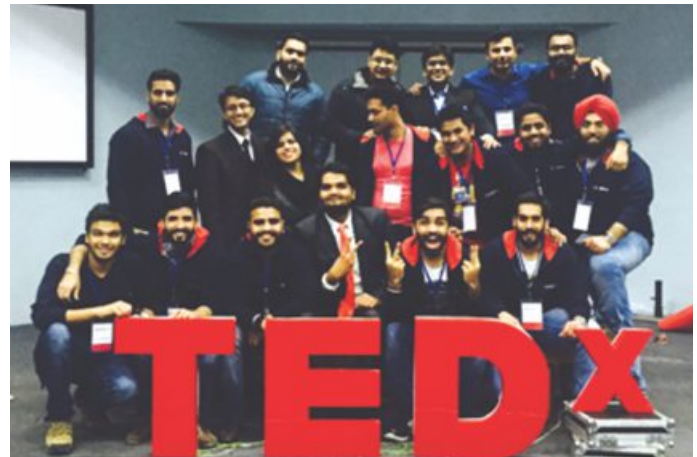
FSM Students at TEDx 2016