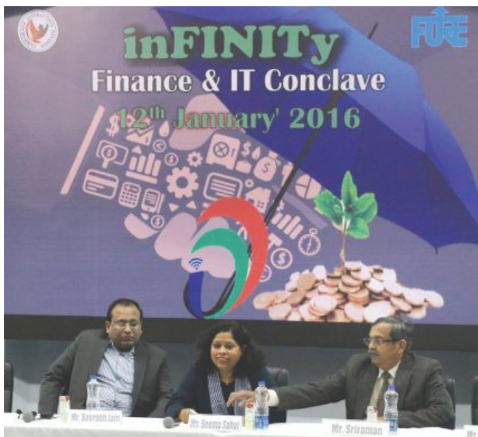
Eminent speakers at the Finance & IT Conclave

January 12, 2016 Corporate Interaction Division organised inFINITY'16 – Finance & IT Conclave. The Finance session was on the topic of Role of Payment Banks and Micro Lending Institutions.