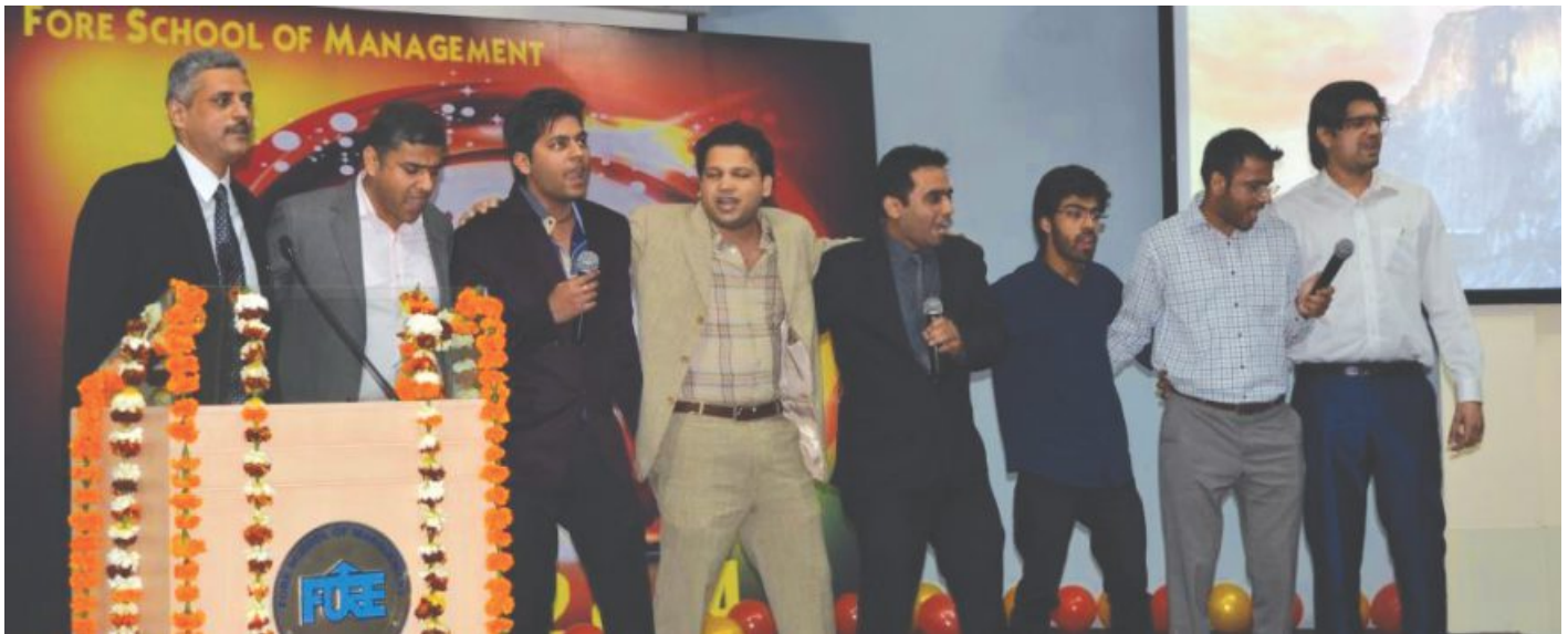
Performance of WMG Students at Prarambh

WMG 23 organized a sumptuous farewell cum fresher's - Prarambh 2016 for WMG 22 and WMG 24 on February 27, 2016.