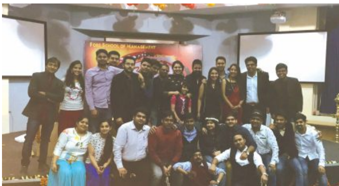
WMG Students at farewell cum fresher's event

"The magic in the air tuned into the chords of pulsating rhythmic hearts and bonds for the years that lay ahead."