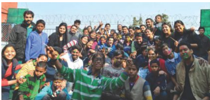
FSM Students with shelter home boys

Aashayein is the most fun loving and an annual flagship event of Team Antar . This year, it was organized on January 10, 2016 in Salaam Baalak Trust, a shelter home for boys by DMRC. Before D day, Team Antar went to Trust to finalize all the requirements for the day and put up poster there. Children seemed to be excited for the day and told their wishes to members beforehand. Around 35 volunteers and 16 team members of Antar took out time to spread joy in the lives of 130 children for one day. The event started with one of their favorite activity, drawing competition, wherein the boys were given crayons and told to draw and color as they pleased. All of them drew amazing sketches, including their favorite cartoons, action heroes and lake side sceneries. This was followed by 'Face Painting' as they were eagerly waiting for volunteers and team members to paint their faces and some of them played with the colors till the end. The boys willingly posed for pictures and proudly showed off their painted faces. Football, cricket and badminton were next in line wherein some children displayed their sporting talent while the others just enjoyed themselves. Thereafter, children lined up for the lunch, which was provided by the college and all volunteers and members enjoyed their meal with them.