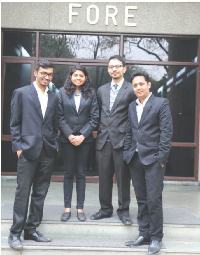
Members of Team Swachh Plastic

Have you heard of 'Biodegradable Plastic'....?!