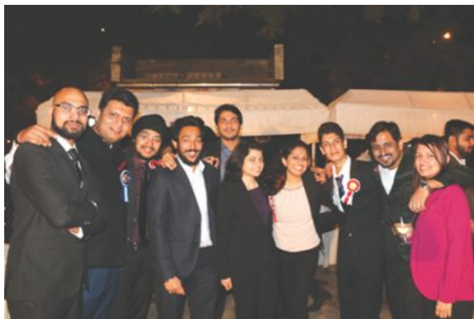
FOREians at alumni meet

Recognition Awards for Contribution to Alma Mater.