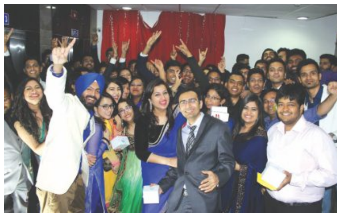
Students at farewell night