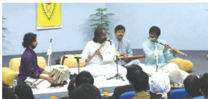
Mr. Rajendra Prasanna enchanting the audience

FORE Sports and Cultural Division organized another Spicmacay on January 20, 2016, in which renowned Hindustani Classical Flautist, Rajendra Prasanna presented.