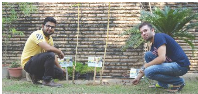
Students during the plantation drive

Team Antar of FORE School of Management successfully conducted the 'go green' drive, Sanrakshan , a tree plantation initiative. As environmental issues are becoming increasingly important worldwide, team Antar also done their bit to protect the future by being as 'green' as possible.