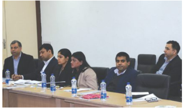
Faculty - Listening in rapt attention

FORE School of Management has received “Best Institute Providing Global Exposure” Award at 9th ASSOCHAM Higher Education Summit 2016 - Role of Higher Education in Leveraging Indian Innovation Ecosystem & National Excellence Awards 2016 held on February 17, 2016 at Hotel Le-Meridien, Janpath, New Delhi.