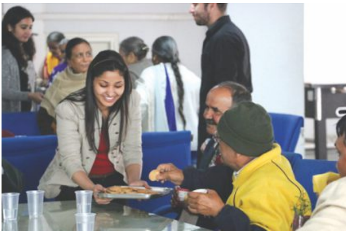
FSM students with Senior Citizens

Soon after, lunch was served by the students to the elders. This was followed by musical chair and cake cutting ceremony along with gift distribution. Students at the college had also prepared cultural dance performance. This marked the end of the event and volunteers took the senior citizens back to their old age homes.