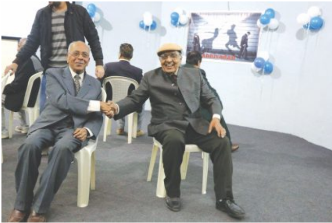
Senior Citizens during the musical chair competition