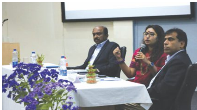
The Hon'ble panelists

A panel discussion on “CSR: Fulfilling the Inclusive Development' Agenda” was organized for the first year students of FMG/IMG batch on February 25, 2016 at FORE campus.