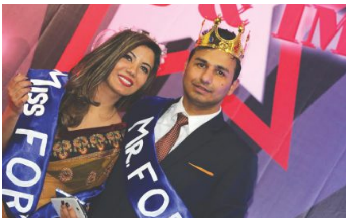
Winners - Ms. FOREian and Mr. FOREian

After the event the seniors as well as the juniors took part in a sumptuous buffet arranged for all. It was a night to celebrate and cherish, and draw the curtains on another successful and memorable chapter in the book of FORE School of Management.