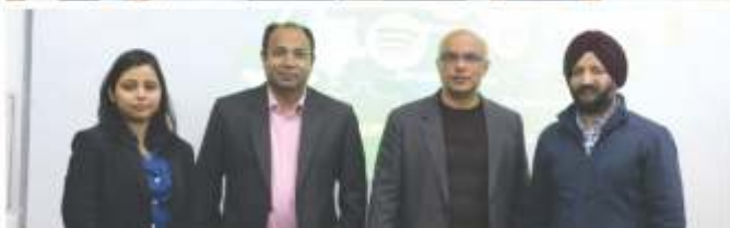
Judges along with the three winning teams of Tathagat

The month of January witnessed yet another nerve wrecking event organized by Team Think Tank, Tathagat 2020. The competition centered around wrecking the brains of the participant in order to find the next best strategy to cope up with a real-life business problem. Apart from industry exposure and huge learnings, the competition offered major cash prizes to be attained by the winning teams. The game plan approach of this competition is something which struck a chord with all curious minds resulting in students registering in huge numbers.