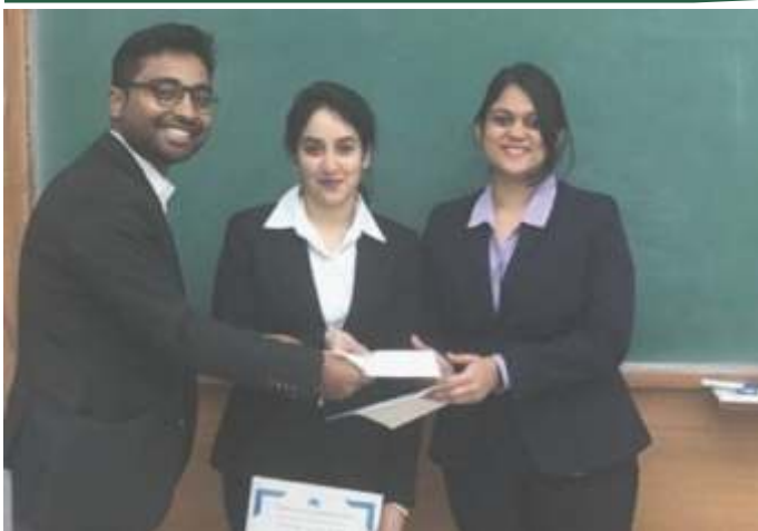
Team Red Wine, winners of Tipping Point

Every marketer's dream is to stand out and leave a mark. Special Interest Group – Marketing had organized a unique and first of its kind inter college competition to test the aspiring and creative marketing minds' Segmentation Targeting and Positioning skills and encourage the participants to think like marketing head of a company. The event kicked off on January 22, 2020.