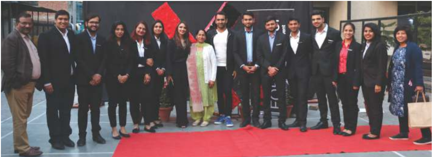
Team TedX posing with the esteemed speakers.

September 27, 2019 was the date Team TEDx had confirmed the return of TED talks to FORE School of Management and their tireless efforts to bring back the same should be highly appreciated.