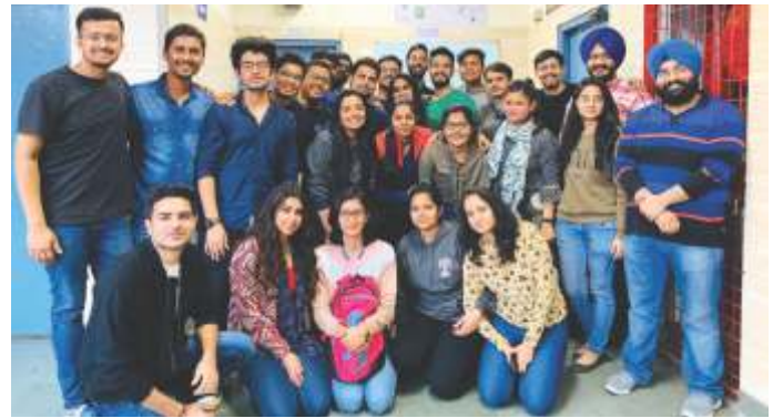
Team Antar posing with the kids during their event Aashayein

Antar conducted its most anticipated event of the year 'Aashayein' on February 23, 2020. Team Antar in association with Salaam Baalak Trust along with more than 30 students visited to DMRC Armaan Shelter Home. The children were on cloud nine when they saw the familiar faces again as they remembered the bond which was created through many years by the FORE students. This year our students brought joy on the faces of around 112 children present at the shelter.