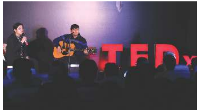
Students performing at TedX FORE School of Management

Besides the inspirational talks delivered at the event by all the engaging speakers, Team TEDx had also provided for other activities and engagements on campus. Prizes were distributed to activity winners on the day of the event. A crucial networking opportunity was provided to all those on campus by enabling them to meet and greet the speakers. Free food and goodies were also organised by the event managers. All in all, TEDx pulled off a massive feat in organising the talk and starting off the new year at FORE with a memorable event.