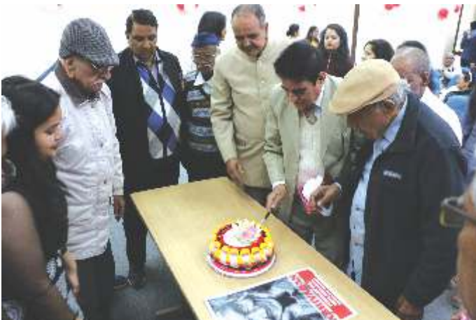
Elderly enjoying celebrations and cutting cake during Abhivadan