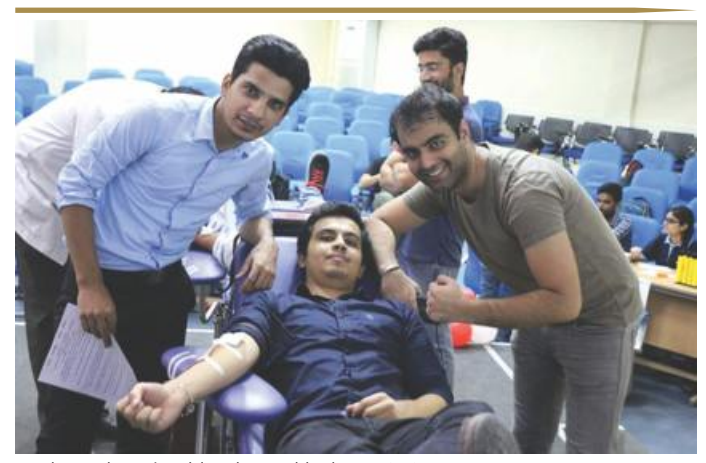
Students donating blood at Rakhtdaan 2018

"One pint; three lives; million smiles" Team Antar, the CSR committee of FORE School of Management in collaboration with FORE Sports and Cultural Division organised its first event for the academic year, the 8th edition of Rakhtdaan on September 6, 2018. The team left no stone unturned to ensure dedicated participation for Rakhtdaan 8.0. The enthusiasm of the students was clearly visible with a huge number coming out to donate blood. The team ensured all the necessary check-ups and arrangements were made for volunteers. The Rotary van arrived at around 11:00 A.M. and the volunteers commenced the setting-up of the venue. The event saw the participation of faculty, staff and students in big numbers. Every donor, whether donating for the first time or a regular one, had the same purpose -- to donate and contribute for the greater good. The event was conducted under the proper supervision of doctors who ensured that the blood was donated the right way. The donors were given refreshments and presented with a bottle as a gift from Team Antar, along with a certificate from The Rotary Club, Tughlakabad Institutional Area, New Delhi, for their genuine and generous contribution. The event was accompanied by 6 volunteers from Rotary, 20 from FORE Sports and Cultural Division and 18 from Team Antar. The FORE family contributed 115 units of blood making Rakhtdaan 8.0 a huge success spreading more and more positivity and awareness for the future.