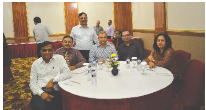
A snapshot of Faculty at Bali

Participants of the tour returned home with excitement, enriched knowledge and a memorable exposure to Indonesian and Balinese culture, economy, and business environment on September 25, 2018. Continuing with the practice, Faculty members of FORE School of Management are expected to bring out 'Working Papers' on a theme related to his/her area of interest with regards to the Bali- FDP. The combined intellectual output from this FDP is likely to be published in the form of a book.