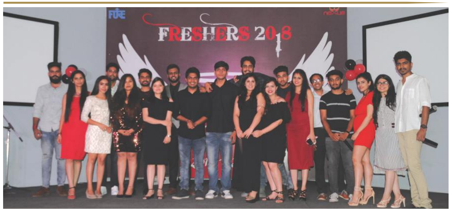
The senior and junior team Nexus at Freshers' 2018

Freshers' 2018 was organized by team Nexus on August 3, 2018a day both the seniors and juniors were eagerly looking forward to. The set-up and the ambience in the auditorium were all very overwhelming. There was a great sense of exuberance in the air. The theme of the day was "angels and demons" and all the décor was tuned to this theme with shades of white and red visible everywhere you see.