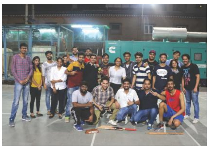
The teams from the final round of Box Cricket League

The former part of the competition was league-based while the latter part of the competition was knockout-based. In the league stage, there were fifteen groups with three teams in each group. Top two teams from each group progressed on to the knockout rounds. The teams that progressed to the knockout rounds were Cigaris and Eleven (Group A), International Dealers and FORE