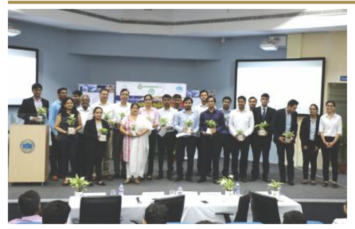
Jury with Participants of Sustainovation organized by Centre for Sustainable Development

To encourage grass- root level thinking and ideas among the student community, Center for Sustainable Development (CSD) partnered with PDS International Private limited (event sponsor) to organize 'Sustainovation: A Social Enterprise Business Plan Competition' for the students of FMG/IMG/FM-1 batch on August 29, 2018 at our campus. The theme for the competition was "Curtailing Air Pollution in India". The aim of the competition was to foster the distinctive ideas among students community on social enterprise venture on curtailing the air pollution in India.