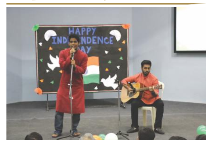
Students performing at the Independence Day Celebration